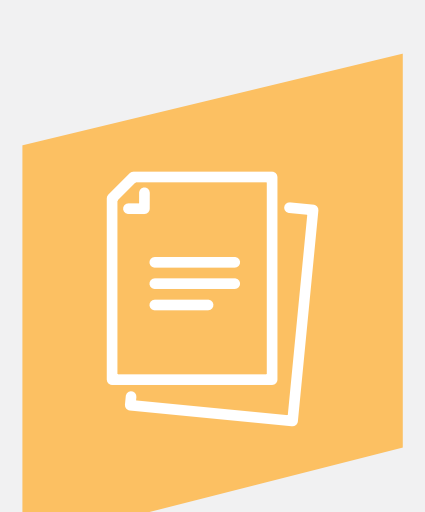
Forms and Declarations